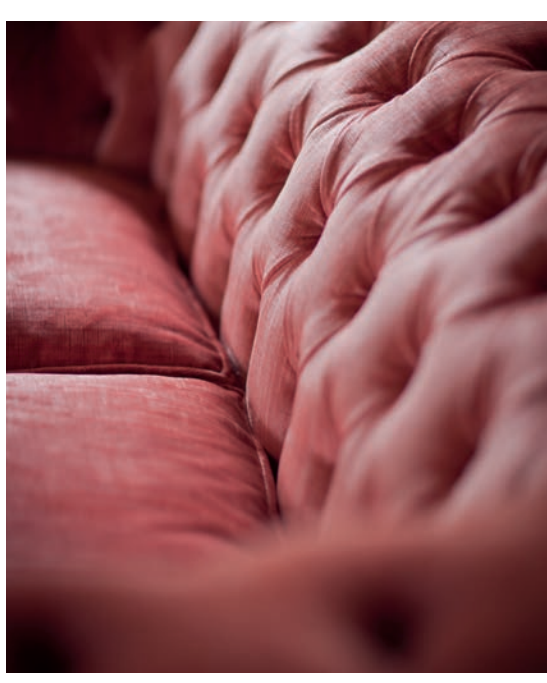
Top: Como Silk Velvets Bottom: Como - Pompeiian Red

We wanted equally beautiful plain fabrics to complement and co-ordinate with our Couture collection and with this in mind, we launched two Silk velvet collections - Como and Capri. Working with Italian mills who weave the most sumptuous soft velvets and with an expertise passed down through generations, the velvets are hand dyed to achieve a palette of subtle colours for which Beaumont & Fletcher have become renowned. Our Como is an exquisite chine silk velvet with immense depth and movement and the Capri is rich and opulent making it perfect for our Couture embroidery. Both offer superior comfort to our furniture.