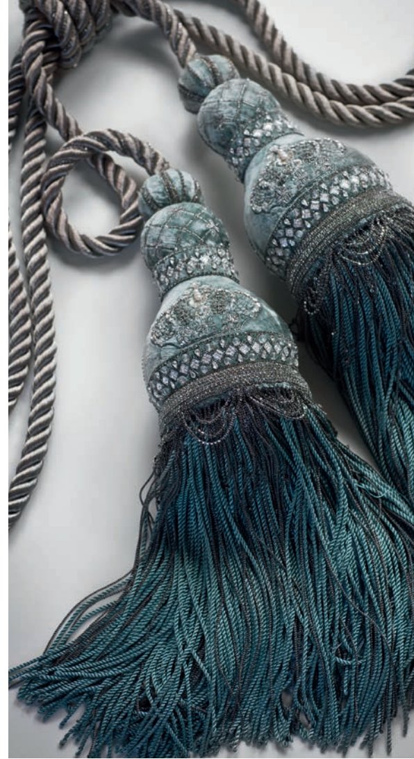
Imperatore on Como - Teal, Bianca Tie back