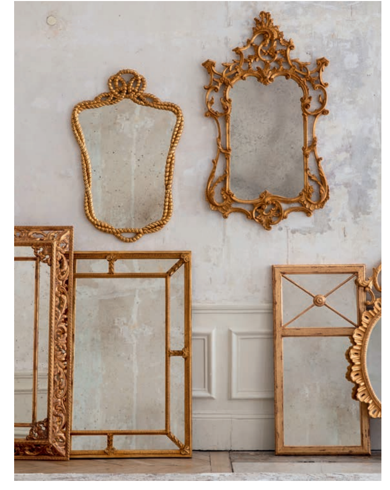
Mirrors from left: Buckingham, Georgian, Nelson, Rococo, Empire, Olympus

In 1995 we introduced Mirrors and Lights into our repertoire. Paying homage to the original pieces - we lovingly recreated their historic forms in small specialist workshops in Italy. Utilising the finest materials and using the skills of master craftsmen we brought these antique inspired lights and mirrors back to life with the softest touch, revealing their understated luxury and hand gilding. They are beautiful statement pieces that sit comfortably next to real antiques.