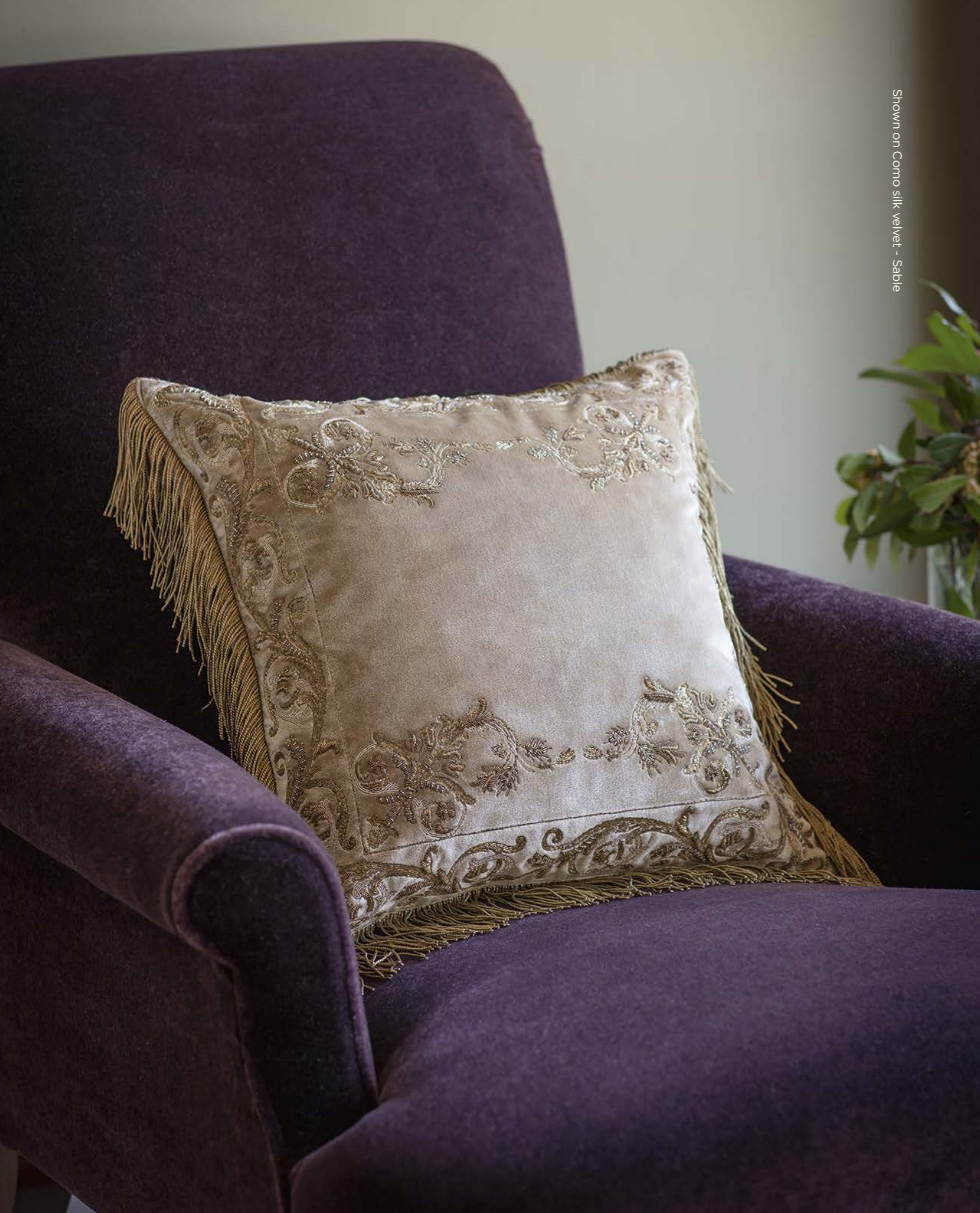
Shown on Como silk velvet - Sable