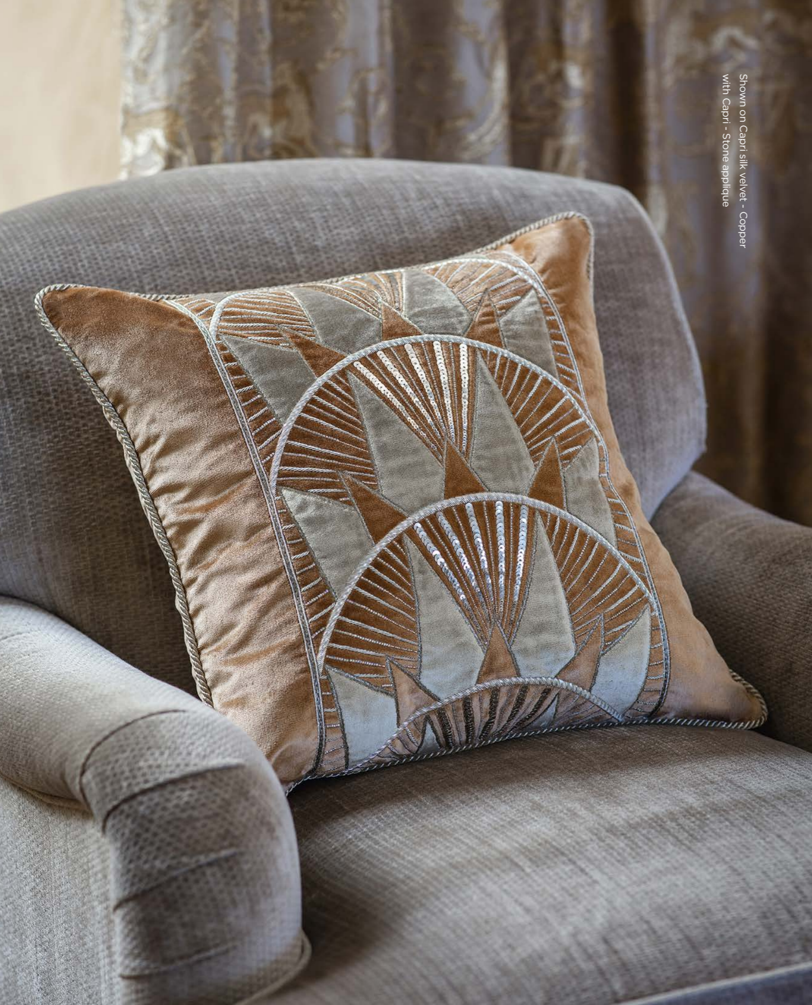
Shown on Capri silk velvet - Charcoal with Capri - Stone applique