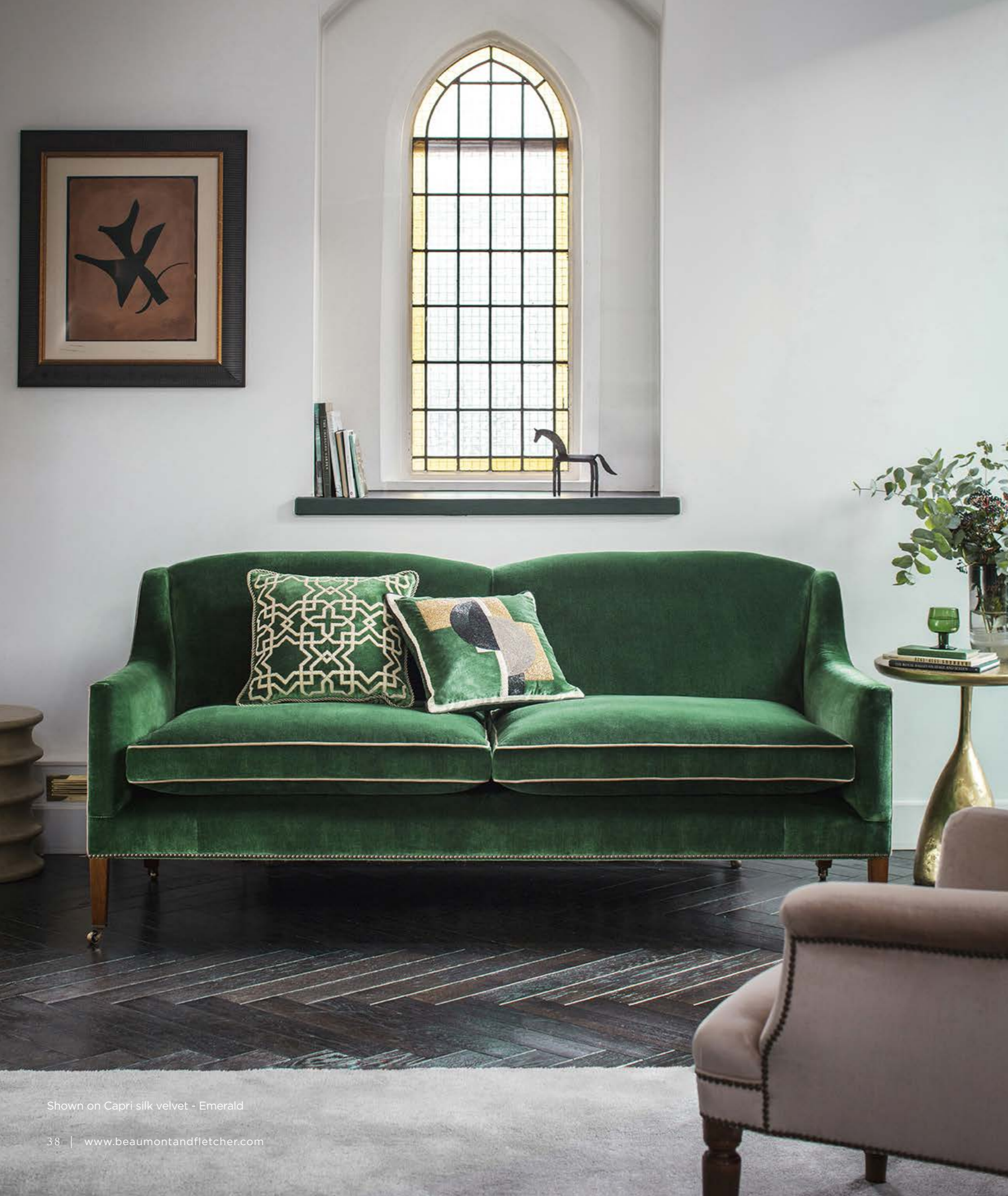
Shown on Capri silk velvet - Emerald