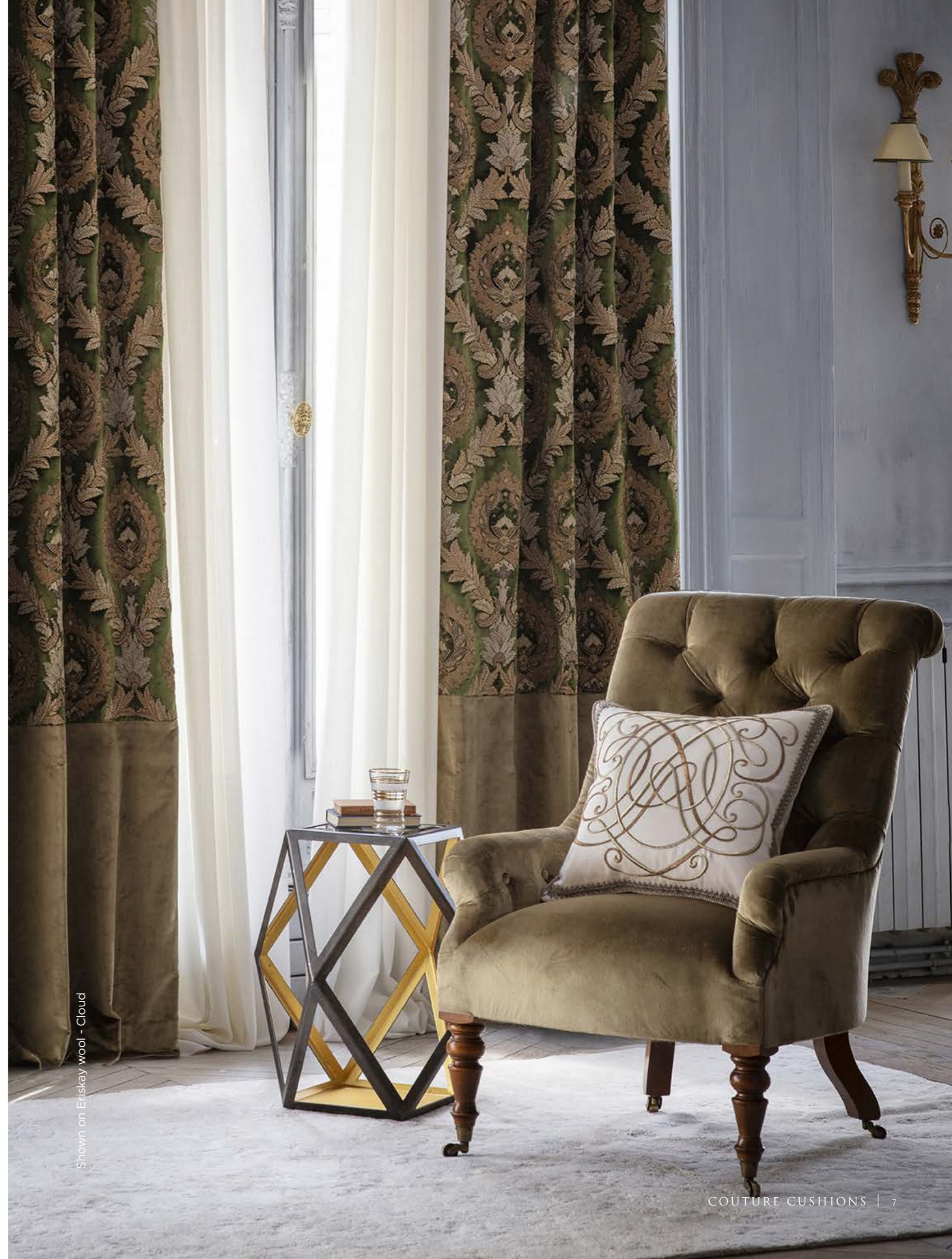
Shown on Eriskay wool - Cloud

Shown on Capri silk velvet - Almond, Como silk velvet - Pompeian red, Teal Eriskay wool - Cloud