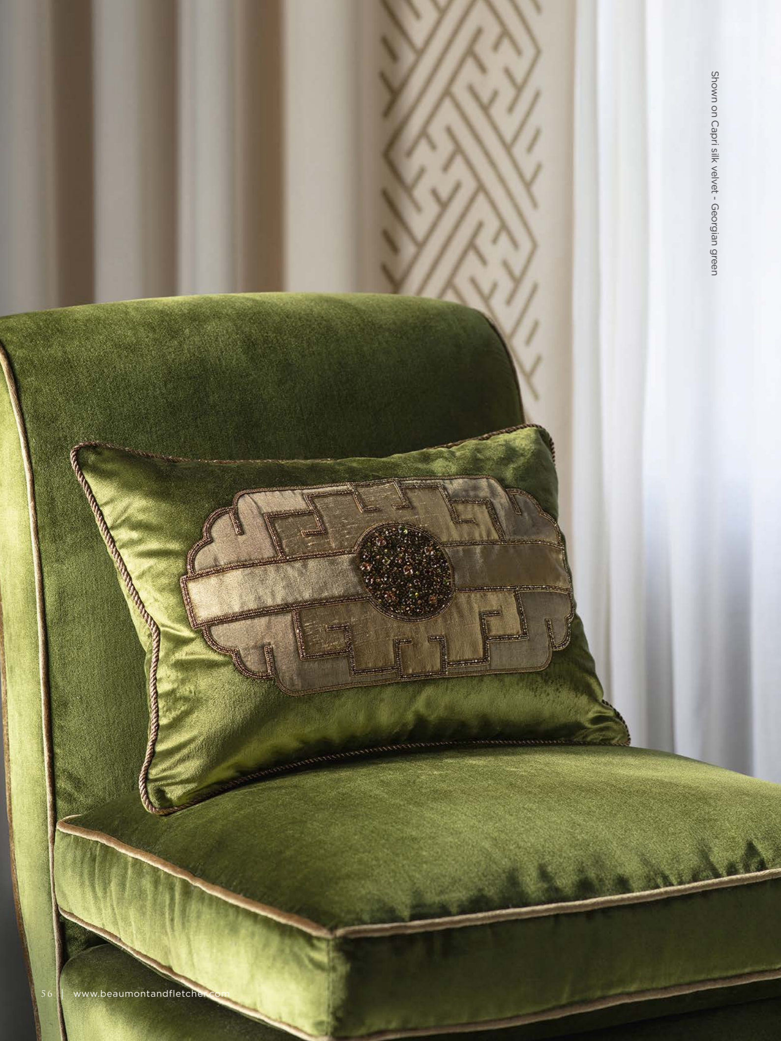
Shown on Capri silk velvet - Georgian green