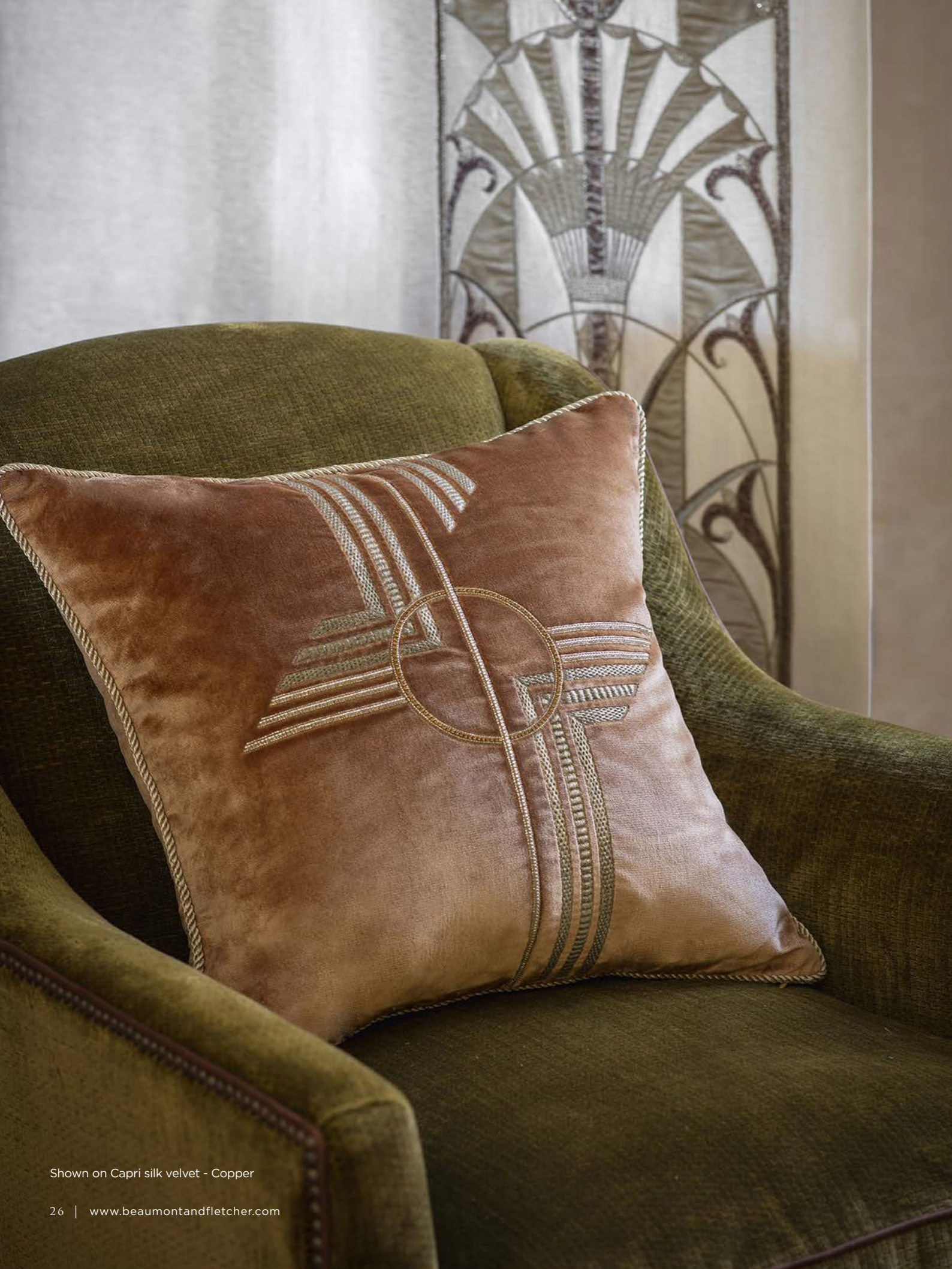
Shown on Capri silk velvet - Copper