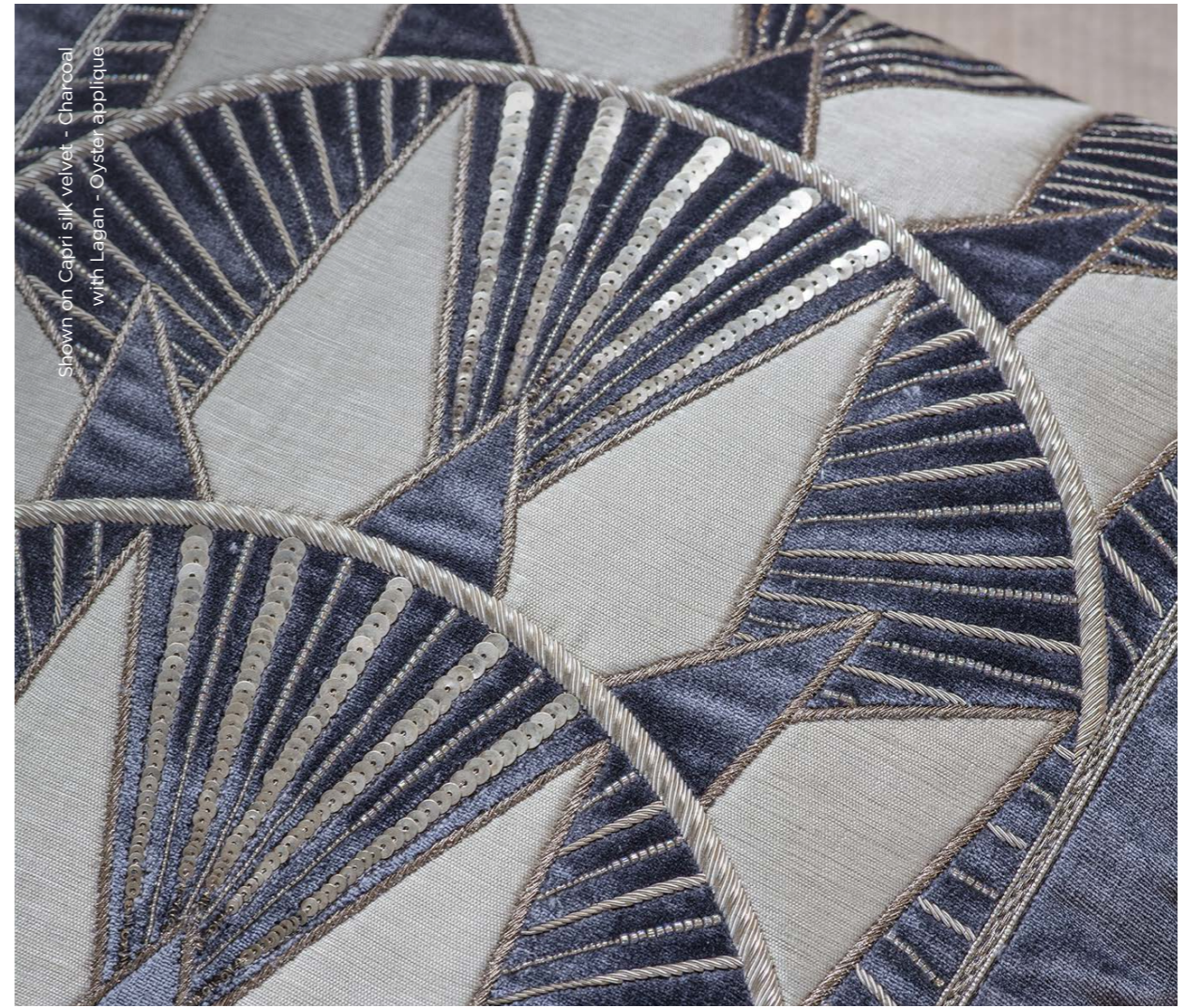
Shown on Capri silk velvet - Charcoal with Lagan - Oyster applique